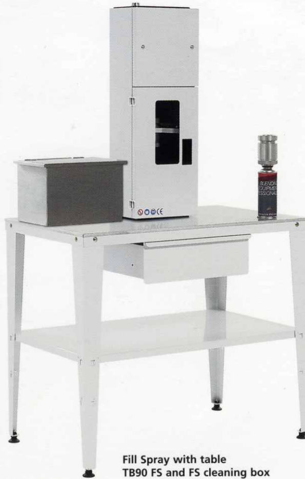
Fill Spray with table TB90 FS and FS cleaning box