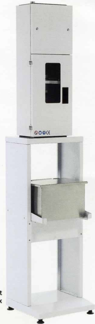
Fill Spray with support T56 FS and FS cleaning box